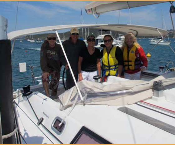
A special thank you for all boat owners who took people for a sail, especially new members Manhattan